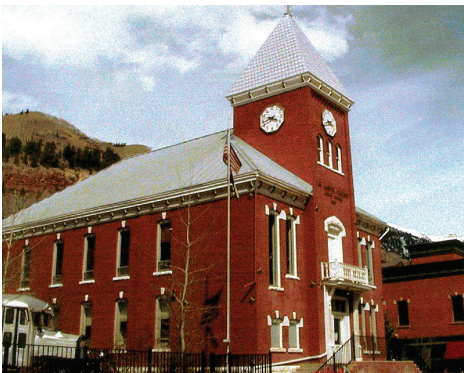
San Miguel County Courthouse