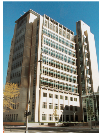
Alfred A. Arraj U.S. Courthouse

To schedule a presentation or to learn more, contact (303) 860-1115 or ourcourts@cobar.org .