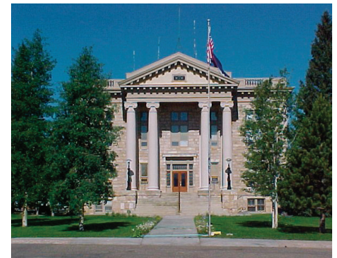
Jackson County Court House