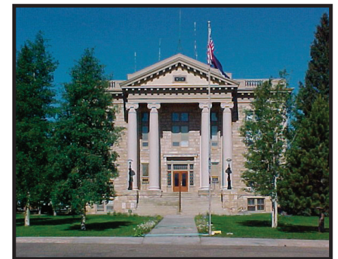
Jackson County Court House