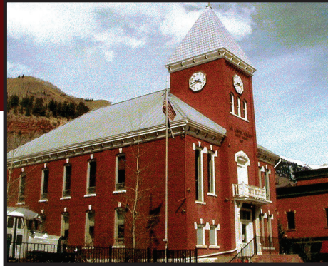
San Miguel County Courthouse

Colo. Secretary of State's Office 1700 Broadway Denver, Colorado 80290 (303) 894-2200